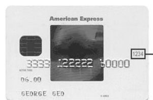
4 Digit Card Verification Number